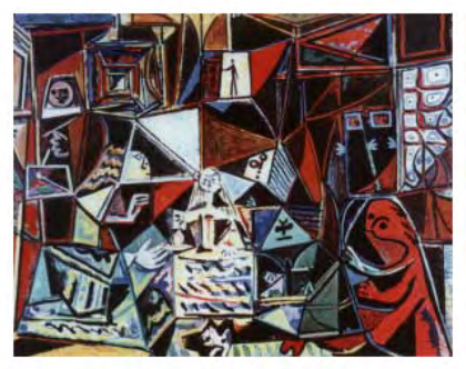
Picasso, Las Meninas (1957, Museo Picasso, Barcelona)

At the end of the XVII century, "space" in mathematics was identified with Physical Space, the space in which natural phenomena take place. And from a corner of this space, conceived as a huge three dimensional container, a box in which objects "float", and using the elements of the geometry of Euclid, mathematicians looked, described and constructed.