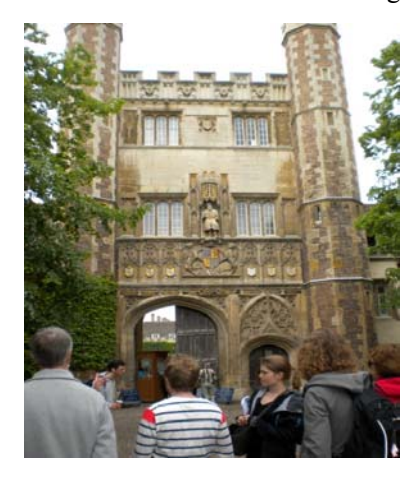
The gate of Trinity College

daily during the terms, a statue of Sir Isaac Newton stands at the west end together