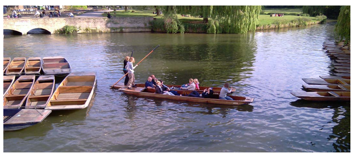
On the last night in Cambridge we enjoyed a nice punting tour in a sunny and warm Cambridge.