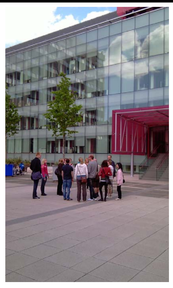
Outside the entrance of Imperial College

Ai Leen Koh talked about how electron energy-loss spectroscopy, EELS, can be used for analyses of nanoparticles for plasmonic applications. These can be used for single molecule detection or for light trapping in solar cell applications. Ai Leen Koh demonstrated the importance of having a monochromator in the EELS system in order to achieve the eVresolution necessary for studies of nanoparticle plasmonics.