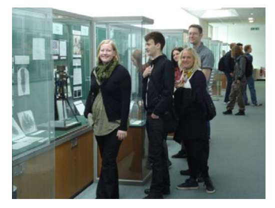
Visit at the Cavendish Laboratory library

a one year project, it was likely to get an extension if the project worked out well. Another topic that was discussed was collaborations between other groups and departments.