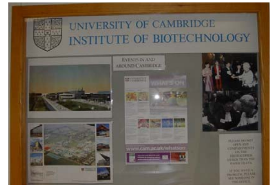
Institute of Biotechnology, an institute today housing 135 people.

The important role of the University of Cambridge as a place for research in Europe was explained in the next presentation. Close communication between the university and numerous companies locally is the main reason for the successful positioning as one of Europe's top biotech areas. Cambridge University is the most aggressive University in Europe in the area of spin-out companies and commercialisation.