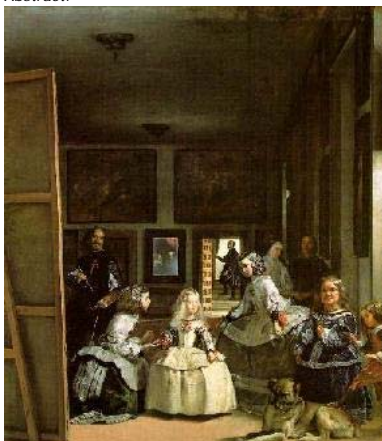
Velázquez, Las Meninas (1656, Museo del Prado, Madrid)