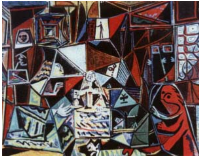
Picasso, Las Meninas (1957, Museo Picasso, Barcelona)

At the end of the XVII century, "space" in mathematics was identified with Physical Space, the space in which natural phenomena take place. And from a corner of this space, conceived as a huge three dimensional container, a box in which objects "float", and using the elements of the geometry of Euclid, mathematicians looked, described and constructed.