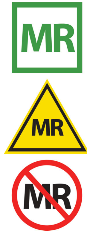
Figure 2. U.S. Food and Drug Administration labeling criteria (developed by ASTM [American Society for Testing and Materials] International) for portable objects taken into Zone IV. Square green “MR safe” label is for wholly nonmetallic objects, triangular yellow label is for objects with “MR conditional” rating, and round red label is for “MR unsafe” objects.

erly identified and appropriately labeled using the current FDA labeling criteria developed by ASTM International in standard ASTM F2503 ( http://www.astm.org ). Those items which are wholly, nonmetallic should be identified with a square green “MR Safe” label. Items which are clearly ferromagnetic should be identified as “MR Unsafe” and labeled appropriately with the corresponding round red label. Objects with an MR Conditional rating should be affixed with a triangular yellow MR Conditional label before being brought into the scan room/Zone IV.